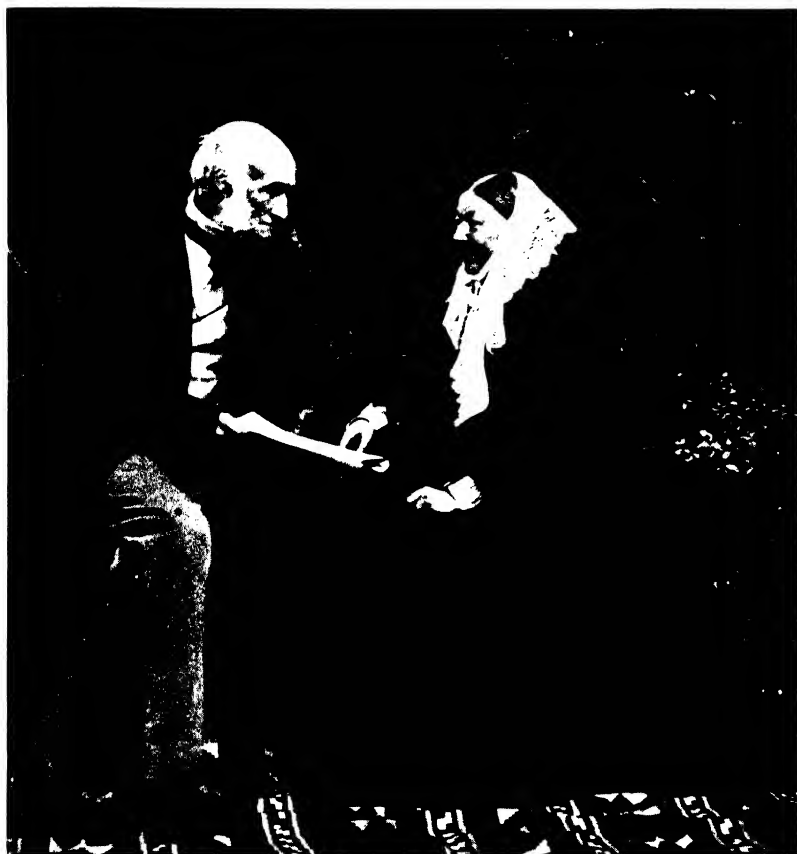
SIR HARRY VERNEY, BART., AND MISS NIGHTINGALE ON THE LAWN OF CLAYDON HOUSE, 1889